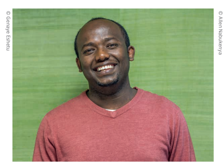
HOLLA supports youth coalitions across the Horn of Africa

'Through Active Citizens I've learnt things that are not taught at school or university, and I now know that I need to work with others in order to succeed.'