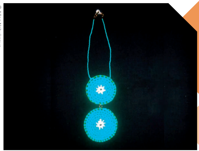
Fusion Art Workshop produces products from recycled material